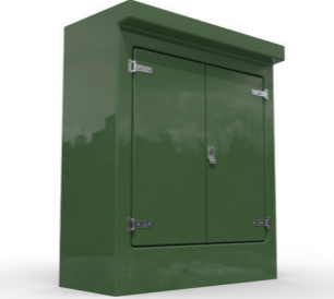
MR - TYPE O