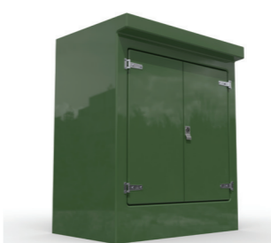
MR - TYPE M