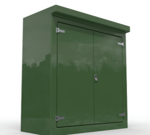
MR - TYPE J