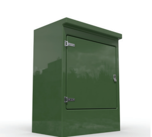
MR - TYPE S