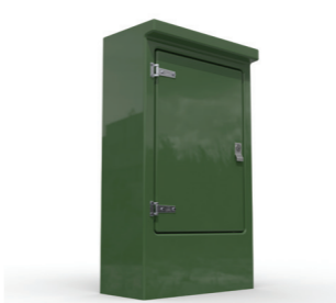
MR - TORBAY