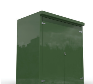
MR - TYPE T