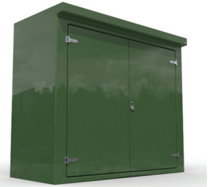
MR - TYPE H