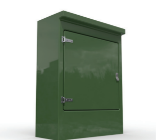
MR - TYPE R